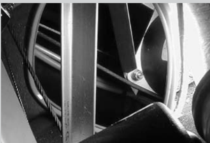
This is where S-TEC found the primary aileron cable.