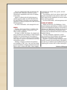
Half Page 6 1/4" x 4 1/4"