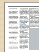
1/6 Page 2" x 4 1/4"

Your advertising contact for the Pilot's Guide to Avionics is: