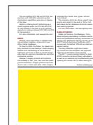
Half Page 6 1/4" x 4 1/4"