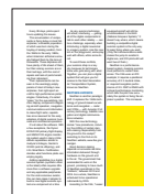
1/6 Page 2" x 4 1/4"