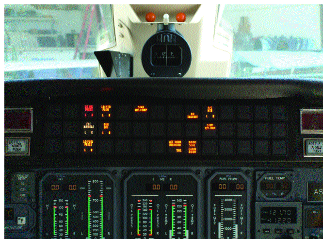
A Citation annunciator panel indicating the “non-normal” conditions for various systems.