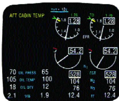
The Boeing 767 EICAS display, showing only the engine parameters needed for the current flight phase. All unrelated scale numerals are removed to increase clarity.

philosophy that has been used to very good success are the Flight Director/Autopilot annunciations on the PFD. Only the modes selected are annunciated. This may seem obvious, but the careful design of these instruments adheres to a common design philosophy that should be carried throughout the cockpit.