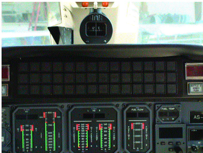
A Citation annunciator panel in the dark, indicating a “normal” condition.

The quiet/dark design philosophy states that information is not displayed until something goes wrong. A screen or annunciator stays black until a system condition warrants notifying the pilot. Much of the typical cockpit already adheres to this philosophy. An annunciator panel light stays dark until the pilot needs to be notified of an abnormal condition.