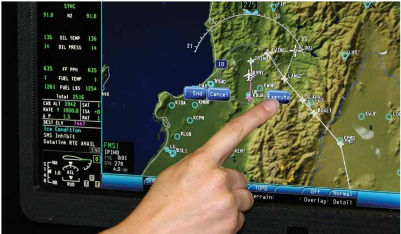
At EAA AirVenture 2011, Rockwell Collins unveiled the industry's first touch-control primary flight displays for business jets and turboprop aircraft, which will be available on future applications of the company's Pro Line Fusion avionics system.