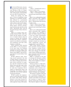
1/3 PAGE VERTICAL