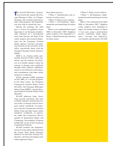
1/2 PAGE VERTICAL