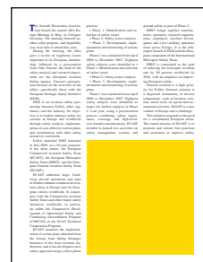
1/3 PAGE SQUARE