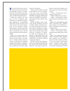
1/2 PAGE HORIZONTAL